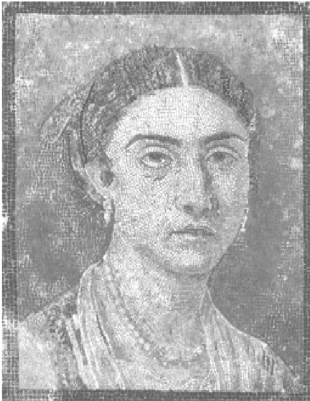
Pompei, mosaic portrait of a woman (late first century BC to early first century AD).